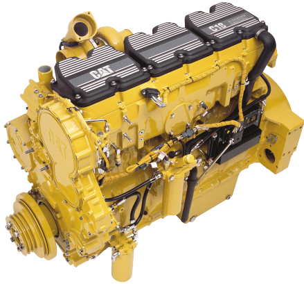
Image shown may not reflect actual engine