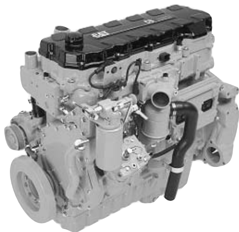
Image shown may not reflect actual engine